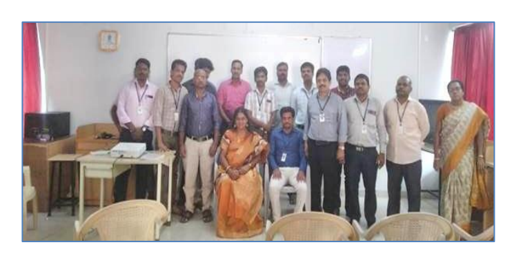
Workshop on Modern Trends in Teaching