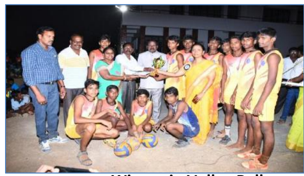
Winner in Volley Ball