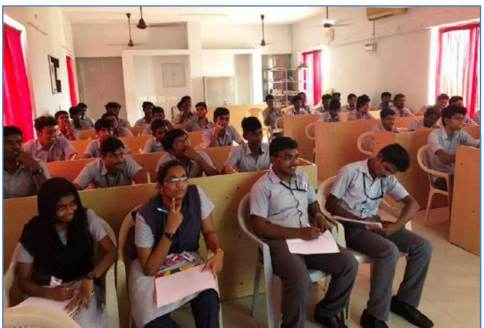
Intra-Departmental Activities in Mechanical Department