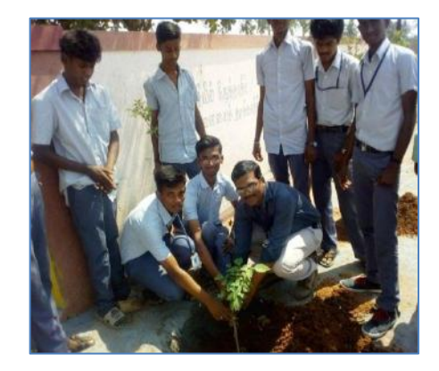
(NSS Special Camp)