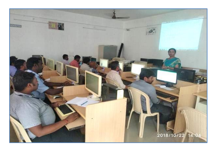
Training on Microsoft Excel