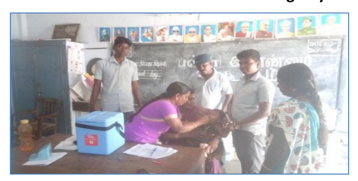
Pulse Polio Camp