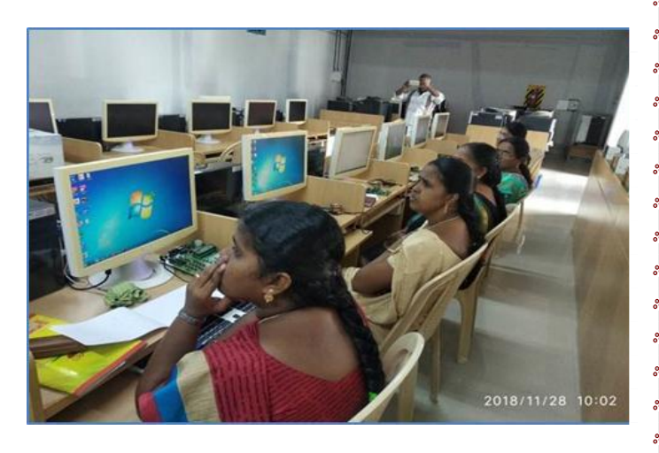
Training on PIC, PLC & Embedded System