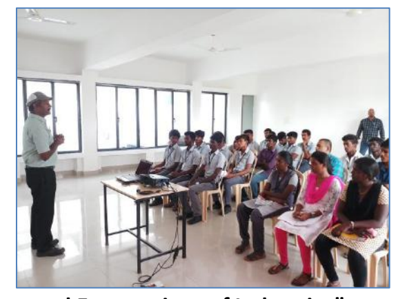
Training on "Preparation for Interview and Expectations of Industries"