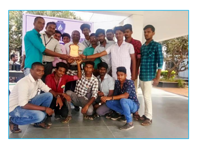
Winners were awarded prizes