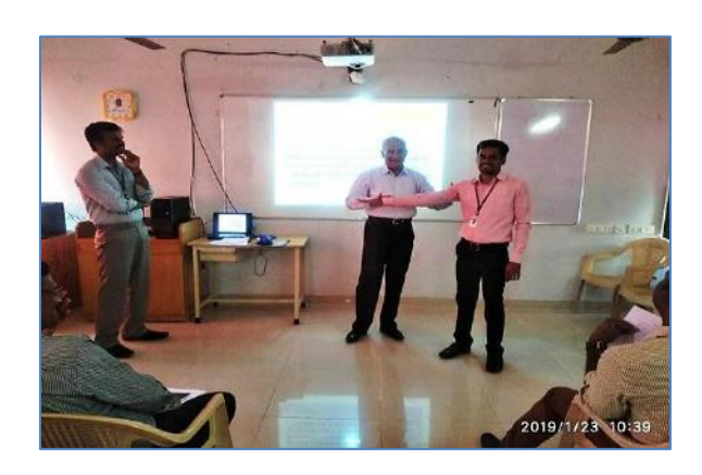
Second Level Counseling Workshop