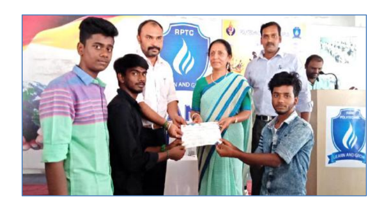
Runner in Carrom – IPAA Tournament, 2018