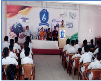
Youth Awakening Day