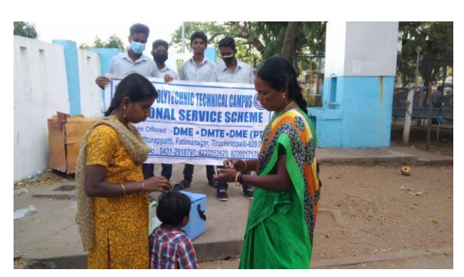
Pulse Polio Immunization Programme