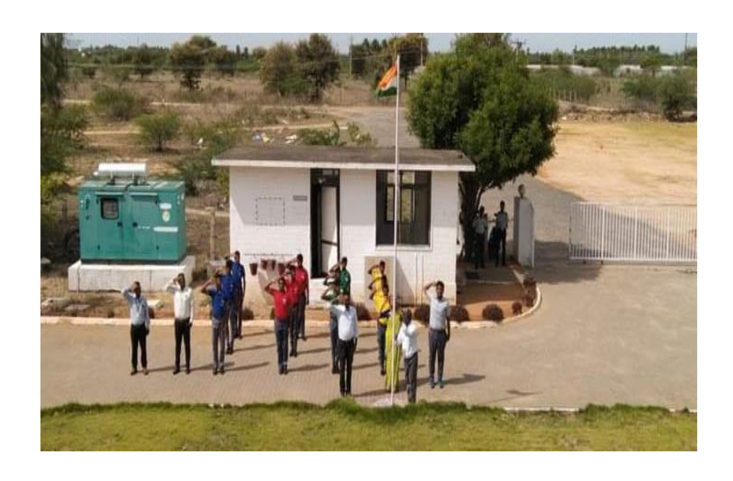
75 Th Years Of Independence Celebration