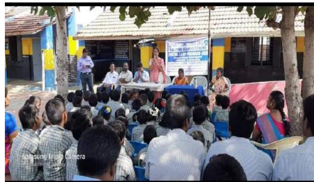
NSS Special Camp Programme