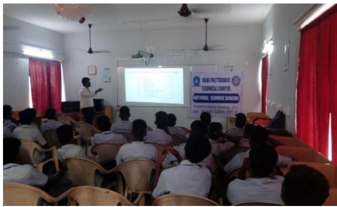
CORONA Virus awareness program