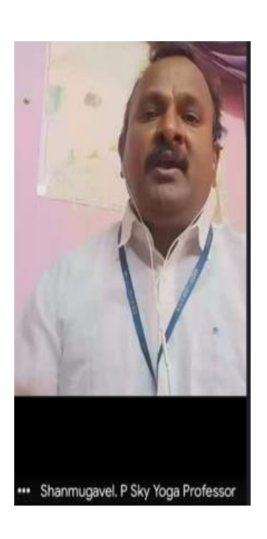
YOGA Day program