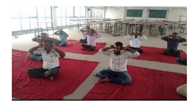
Fit India Challenges-Yoga