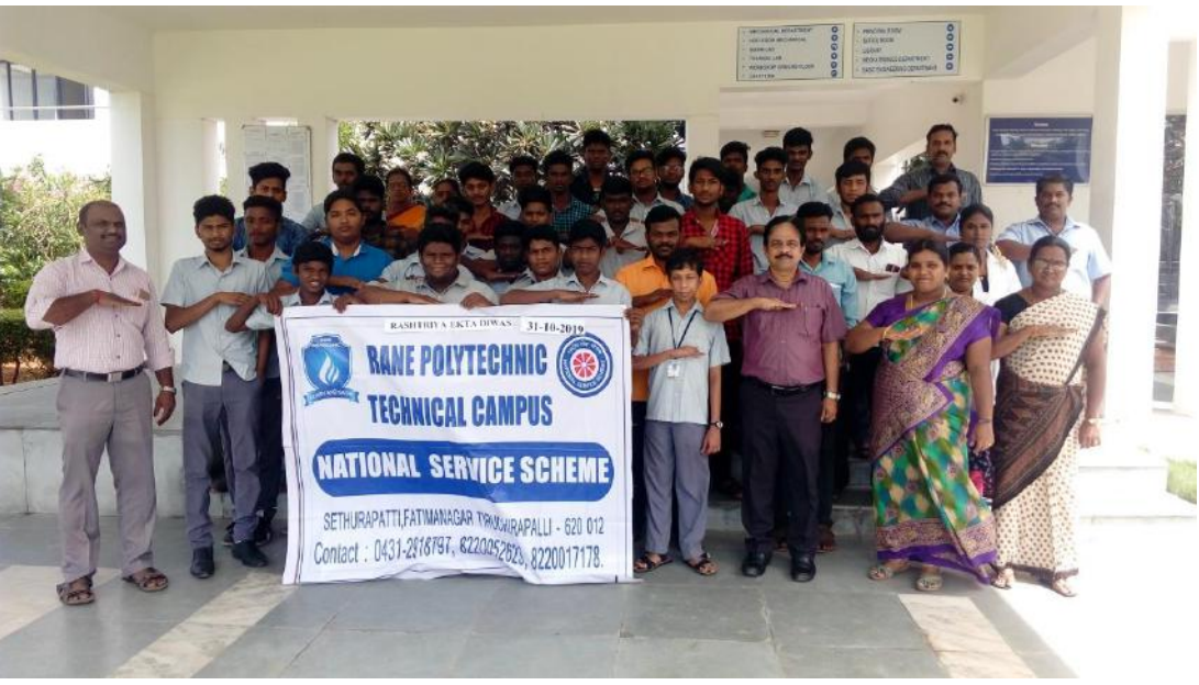
Rashtriya Ekta Diwas Pledge