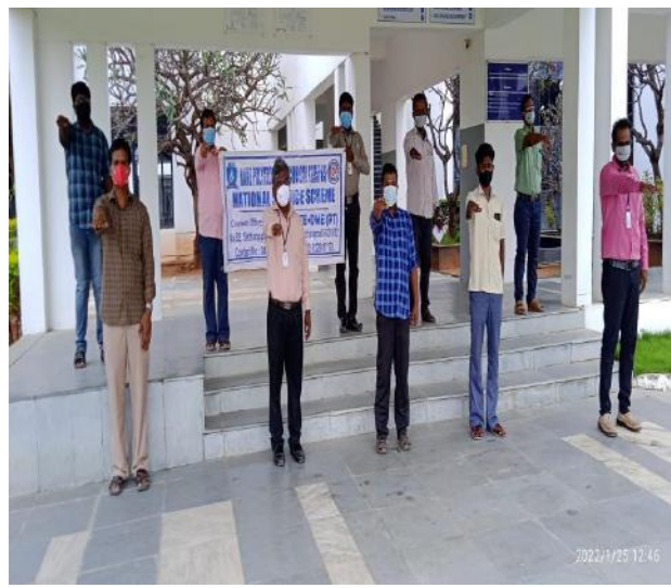
Voters Day Pledge