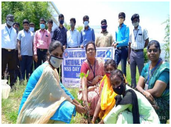
NSS DAY Celebration