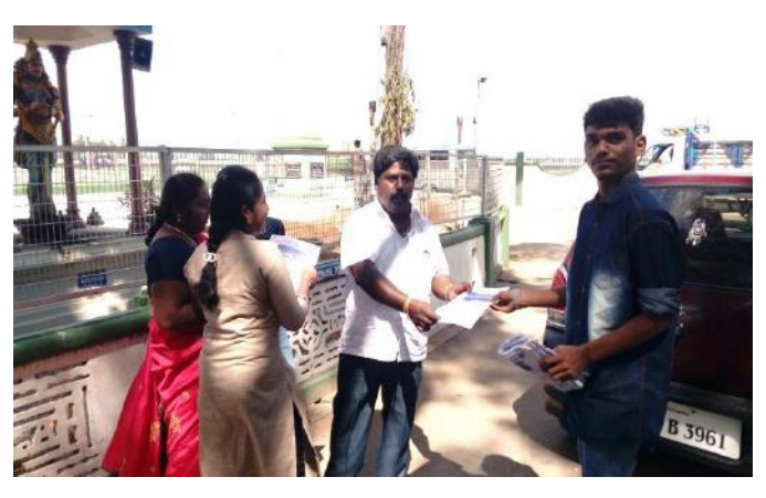
Pulse Polio immunization program