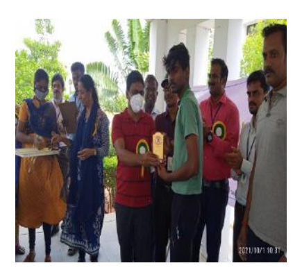
Fit India Freedom Run 2.0