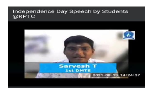
75<sup>th</sup> - Independence Day Celebrations.