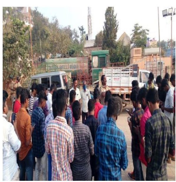
Viralimalai Kumba abishekam - Celebrations.